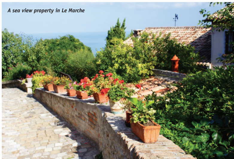
A sea view property in Le Marche

It's simple. Foreign buyers want to feel comfortable and protected. They don't know the rules of the game. They sometimes don't even know the questions to ask. Who better to ask than an impartial attorney? That is why Marche Homes Direct teamed up with Marche Legale and avvocato